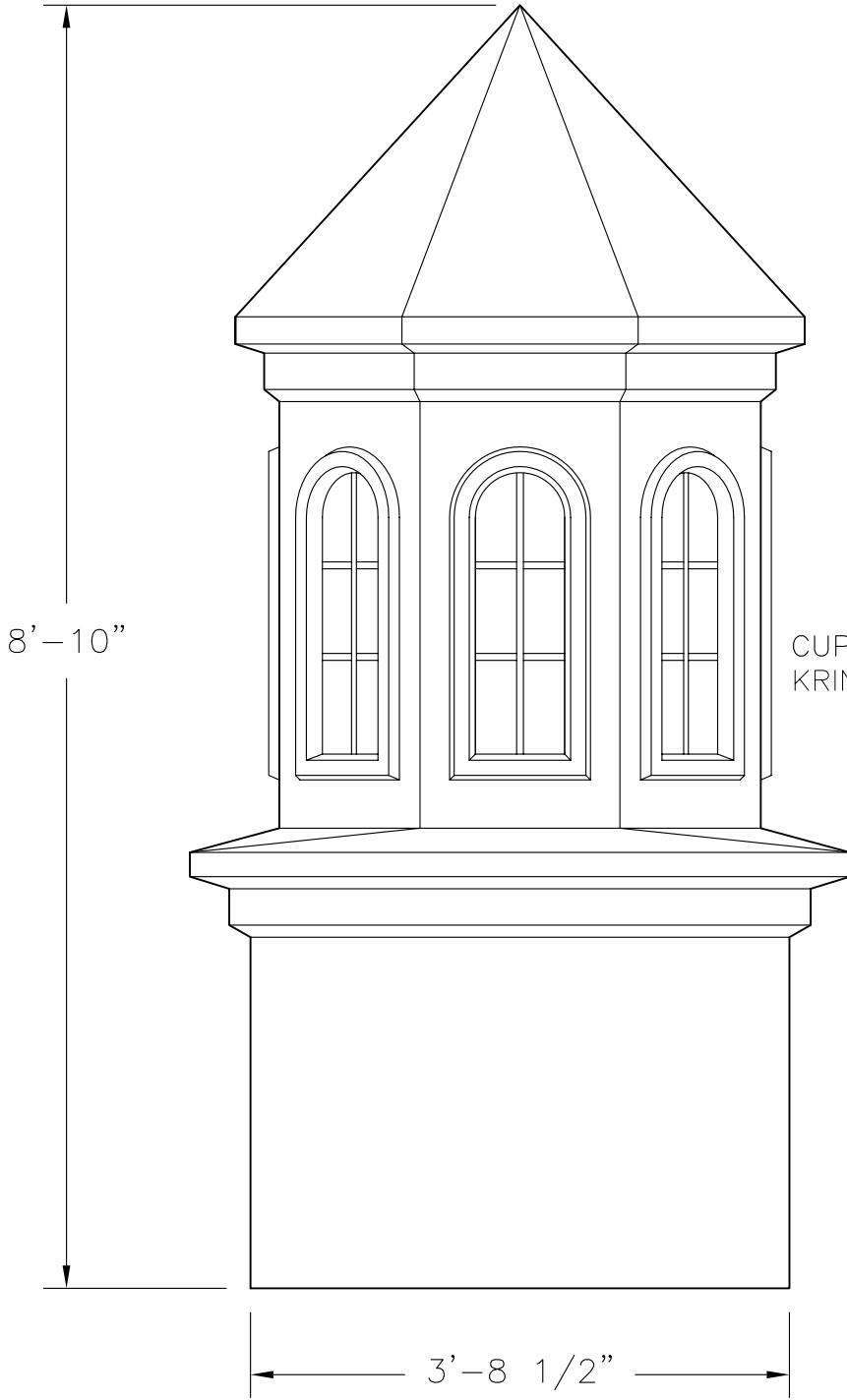
CUPOLA UNIT #1103S WITH KRINKLGLAS WINDOWS