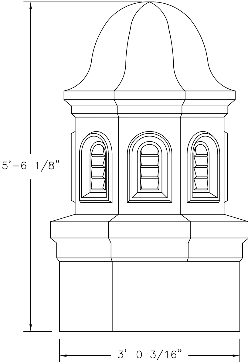
CUPOLA UNIT #1156 WITH FALSE LOUVERS